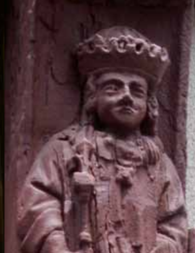
St. Louis on the Saint-Martin Residence..