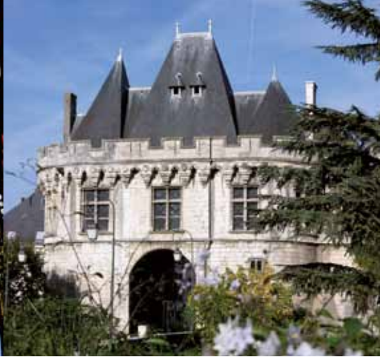
Since 1467, the St. George Gate has housed the meetings of the Town Council.