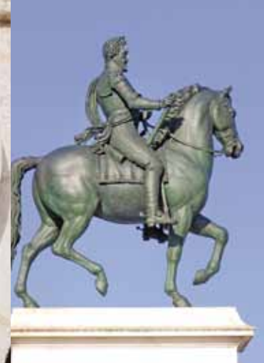
Henri IV (1553-1598), third Duke of Vendôme. Paris near the Pont Neuf