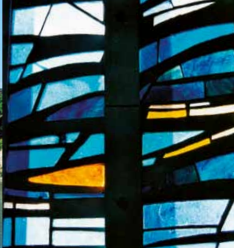
Contemporary stained glass by Anne Huet, Church of N.-D.-des-Rottes.