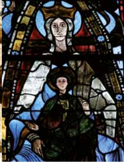
Madonna and Child, a stained-glass window dating from circa 1125 in Holy Trinity abbey church.