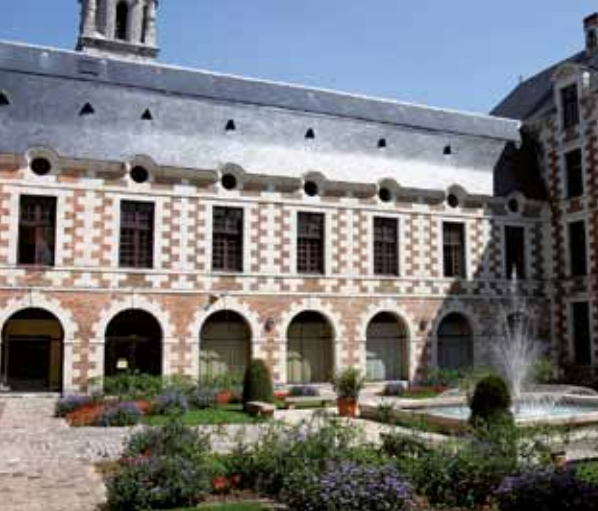
The main courtyard in the Town Hall.

From the playground in the old high school to venerable plane trees on the banks of the River Loir, see places steeped in history.