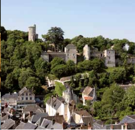
From the southern hillside, the castle and its park overlook the town.