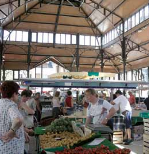
Every Friday, the streets around the covered market are filled with the bustle of the market.