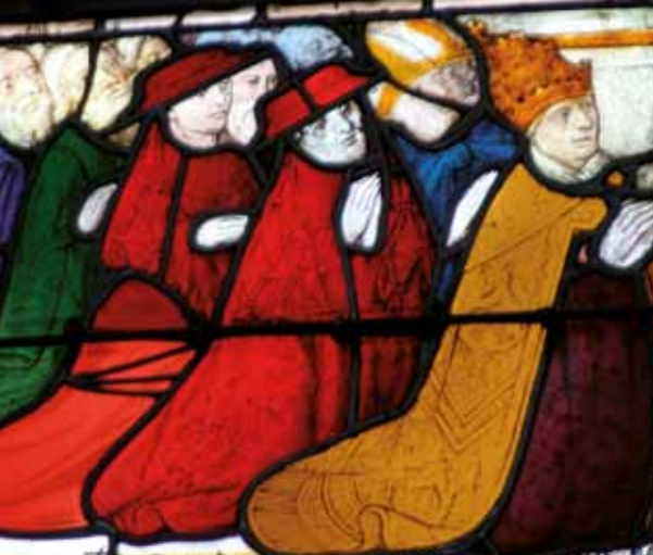
Cardinals and priests, a close-up of a stained-glass window in Holy Trinity Abbey Church.

The building of a high-speed train (TGV) station in 1990, bringing Vendôme to within 43 minutes of Paris, was accompanied by major changes in the town's economic fabric. It has particular expertise in three main, distinct sectors: aeronautics, domestic appliances and the automobile industry. Thanks to its wide range of shops and services, its dynamic cultural life and its many associations, Vendôme is now a regional centre for development covering an area that has a population of 70,000.