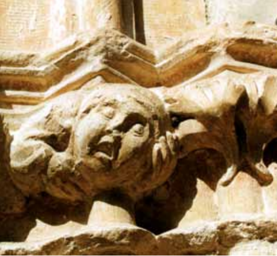
Sculpture in the chapter house.

Stroll through the streets of the town and look at its historic monuments. This walk takes you through the pages of the town's history.