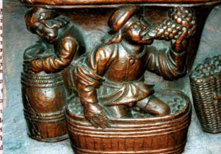
A sculpture of vignerons carved in the late 15th century on the choir stalls in Holy Trinity Church.