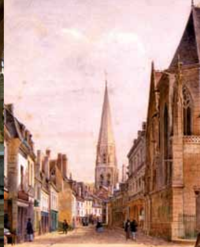
Rue du Change in 1856, a water colour by Gervais Launay.

There are two sightseeing walks starting from the Tourist Office, together designed to show you all the heritage buildings in the historic town centre.