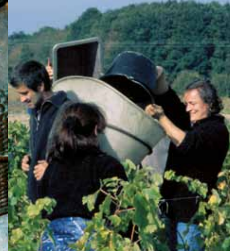
Harvesting on the hillside at Les Coutis.