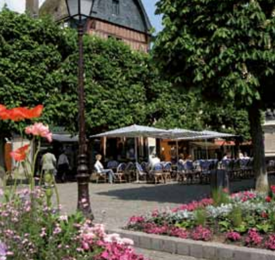
Place Saint-Martin in the town centre.

Pierre de Ronsard (1524-1585) "Odelette du Bocage" de 1554 - Livres des odes de jeunesse.