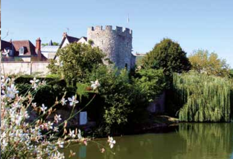
The Islette Tower.