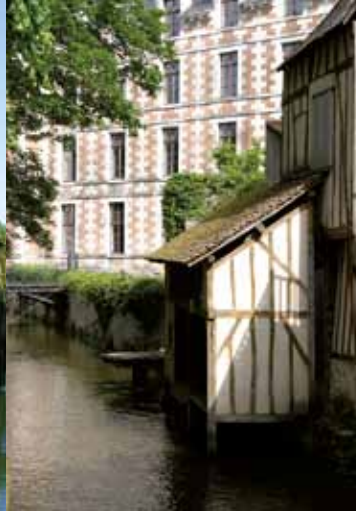
The Franciscans' wash-house (late 15th century).