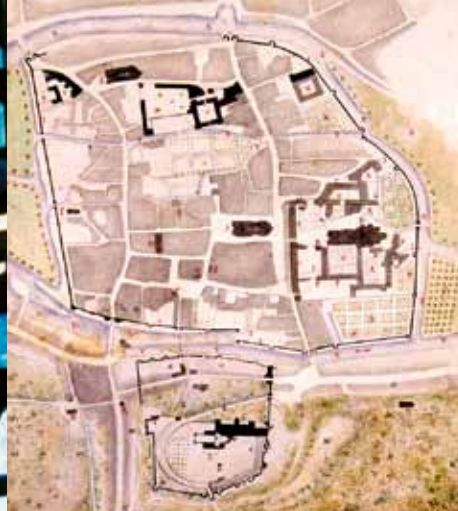
Vendôme in the 17th century copied by Gervais Launay in the 19th century.