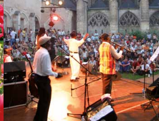
A concert during the Rendez-Vous de l'Été summer festival.