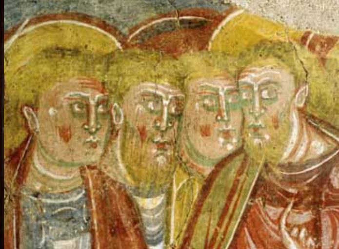
"The Miraculous Catch of Fish", an early 12th-century fresco in the chapter house.