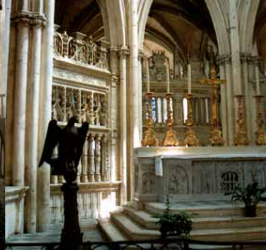
The chancel in Holy Trinity Church.