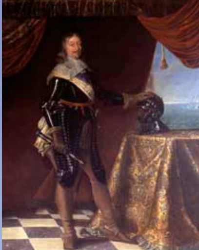
Caesar of Vendôme (1598-1665), Henri IV's illegitimate son. Painting in the Registry Office in the current Town Hall.