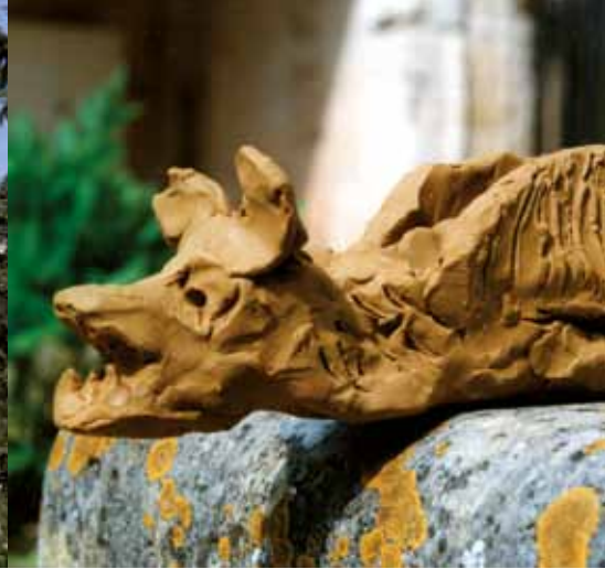
A clay gargoyle made in a children's Arts workshop.