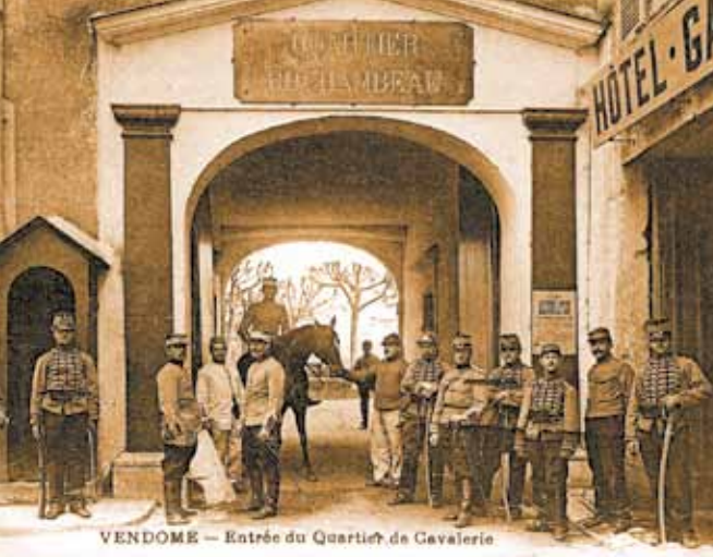
Soldiers from the 20e Chasseurs à cheval (light cavalry) in front of the Rochambeau Barracks in the former Holy Trinity Abbey.

From the ancient Benedictine abbey to the town's gates, all these picturesque places will tell you their own story.