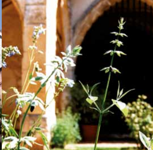
Numerous different botanic varieties (here, an Andean silver-leaf sage) bloom in the "Fragrance Garden" in the cloister garth.