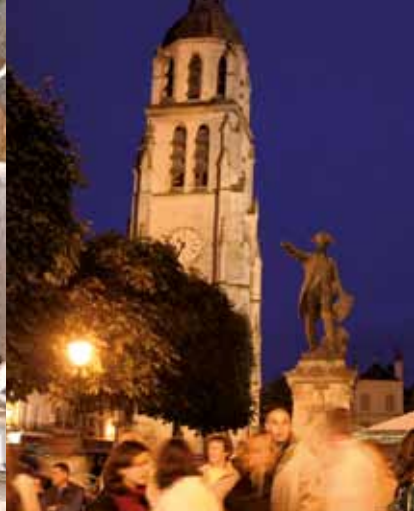
St. Martin's Tower rings out the hours, providing a rhythm to life in Vendôme.