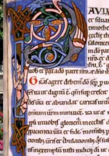
One of the 232 mediaeval manuscripts preserved in Vendôme's library. Commentary on the Epistle of St. Paul (Ms 23 - F.165 - 12th century).