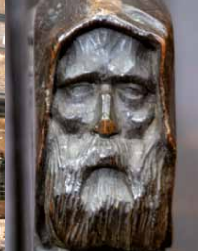
A sculpture of a monk on the choir stalls in Holy Trinity Church..