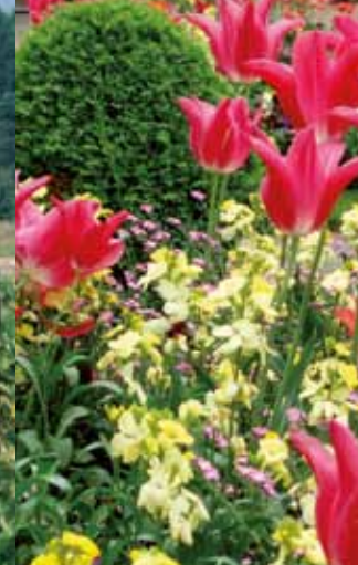
A close-up of flower beds in the Ronsard Park.