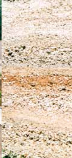
Limestone rocks on the southern-facing hillsides..