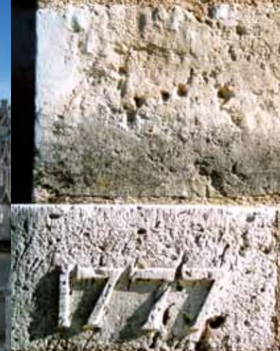
A close-up of the former Oratorians' high school.