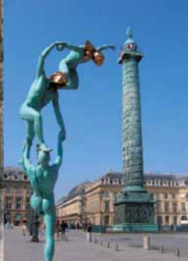
The mansion that belonged to the Dukes of Vendôme, was demolished when the royal square was laid out in the late 17th century but it has given its name to a famous square in Paris.