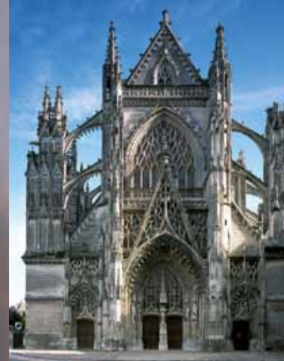
The Flamboyant Gothic façade of Holy Trinity Church.