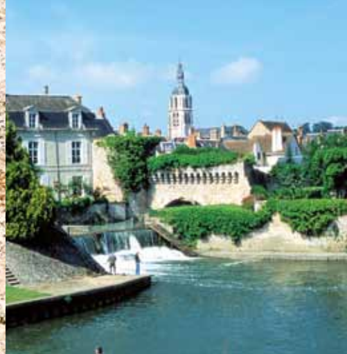
The watergate or Great Meadow Arch spanning the River Loir.