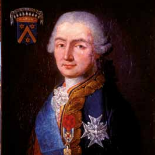
Maréchal de Rochambeau (1725-1807), who was born in Vendôme. Painting in Vendôme Museum.