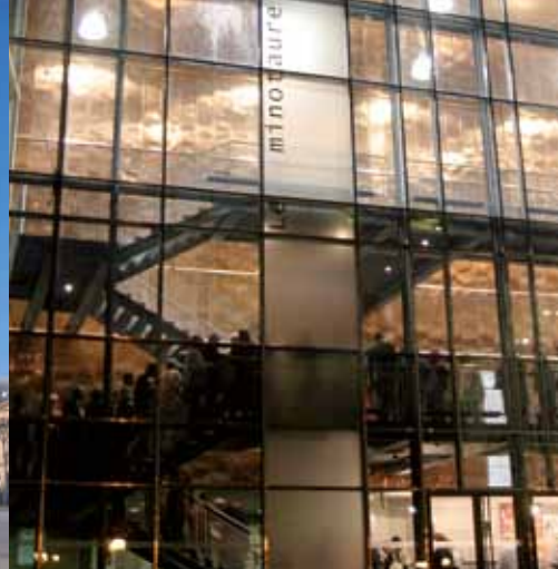
A close-up of the copper wall of Le Minoature, a theatre designed by Gaëlle Péneau.