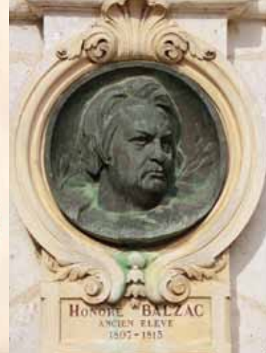
Honoré de Balzac (1799-1850), pupil in Vendôme. Town hall of Vendôme