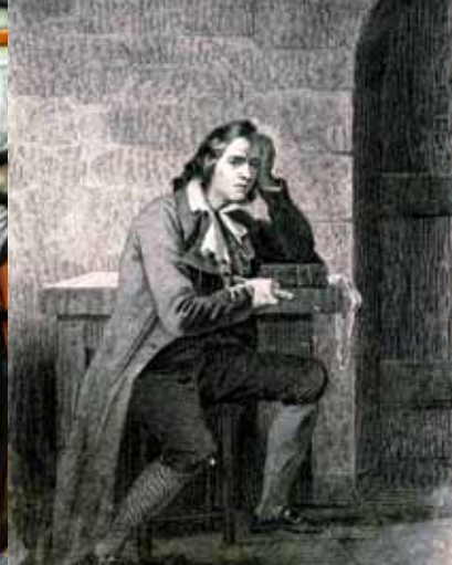
Gracchus Babeuf, one of the leaders of the "Conspiracy of Equals", was tried and executed in Vendôme in May 1796.