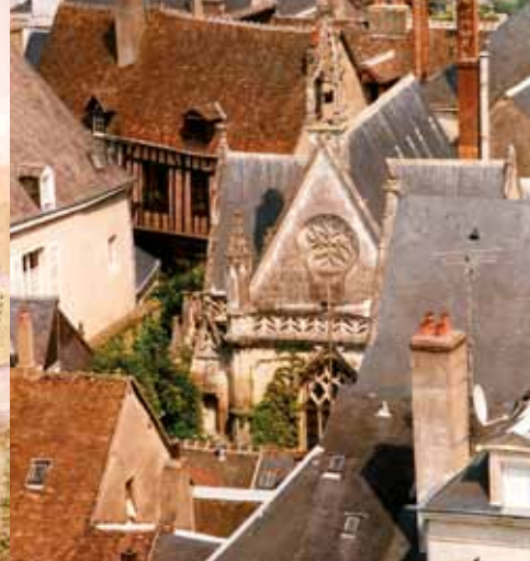
Private chapel of Our Lady of Pity.