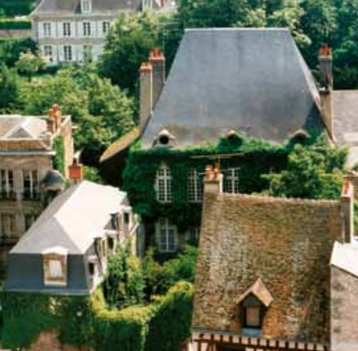
One of the private mansions in Rue Guesnault provided author Honoré de Balzac with inspiration for the story of La Grande Bretèche.

Since the 1980s and 1990s, urban development has continued beyond the southern hill that once formed a natural barrier. Property development was carried out in the south, in the district of Les Aigremonts (meaning "scarp slopes"), distributing the population and activities over a town that now has 18,500 inhabitants within an area that boasts a population of more than 30,000.