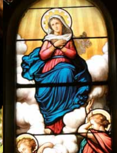
A 19th-century stained-glass window showing the Assumption of the Virgin Mary by the Lobin Studio, in the Church of Mary Magdalen.