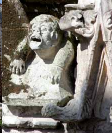
A close-up of a carving in St. James' Chapel (chapelle Saint-Jacques).